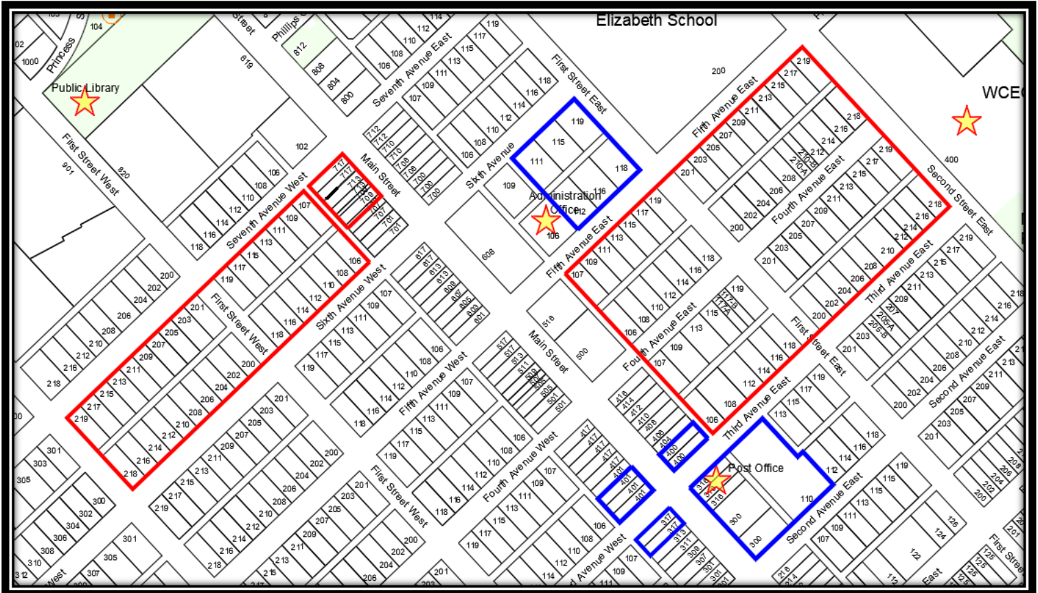
Map of Affected Properties. Properties in the BLUE areas will have intermittent water disruptions, Properties in the RED areas will be attached to a above ground temporary water line.

Garrett Bullee (Con-Tech Project Manager) (306) 290-6793